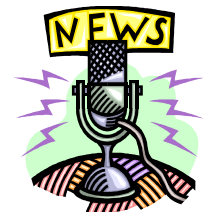
News you can use!

Have a question you can't find an answer to? Stop in or call one of the township offices for help!