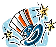
Celebrate in Ramsay!

Here's a look at the festivities happening for weekend of July 4th: