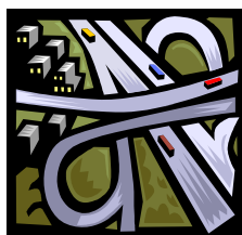
Working towards improvement

VOLUNTEERS NEEDED! There is always a need for anyone who would like to be a part of this on-going tradition.