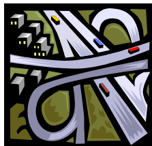
Working towards improvement